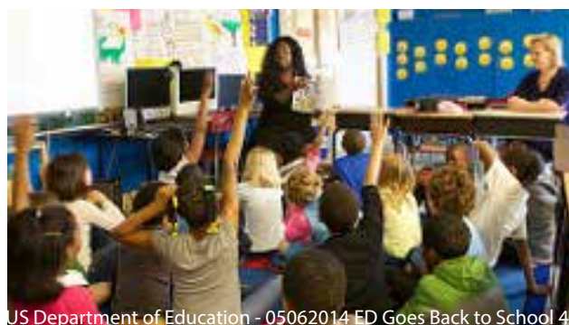
US Department of Education - 05062014 ED Goes Back to School 4

“I feel that I have achieved something, I have wanted to do it for a long time but never got the chance and the adult learning centre helped me achieve this.” STALIS Level 3 learner feedback.